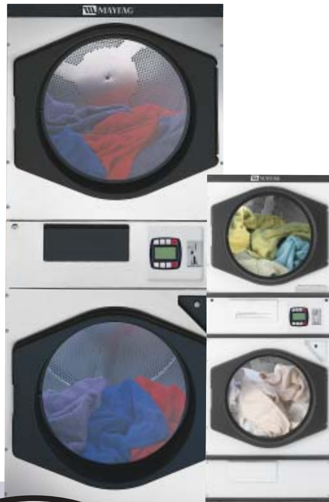
Model MLG31PC shown in White.

SMALLER FOOTPRINT REQUIRES LESS FLOOR SPACE.